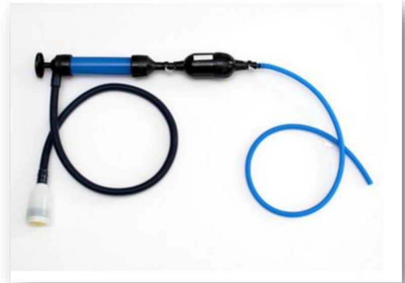
Included with the Pump2Pure Kit with Dual Supreme Filtration:

Protect yourself and those you love...filter your drinking water using Pump 2 Pure from any nearby water source and be assured of receiving clean, great tasting, guaranteed quality drinking water.