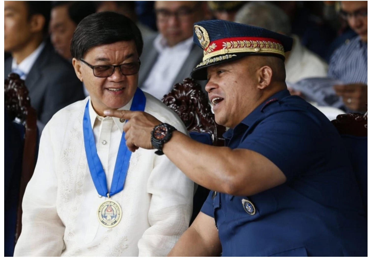
Two of Duterte's key Cabinet members instrumental in Duterte's murder of the weak, the poor and the ill.