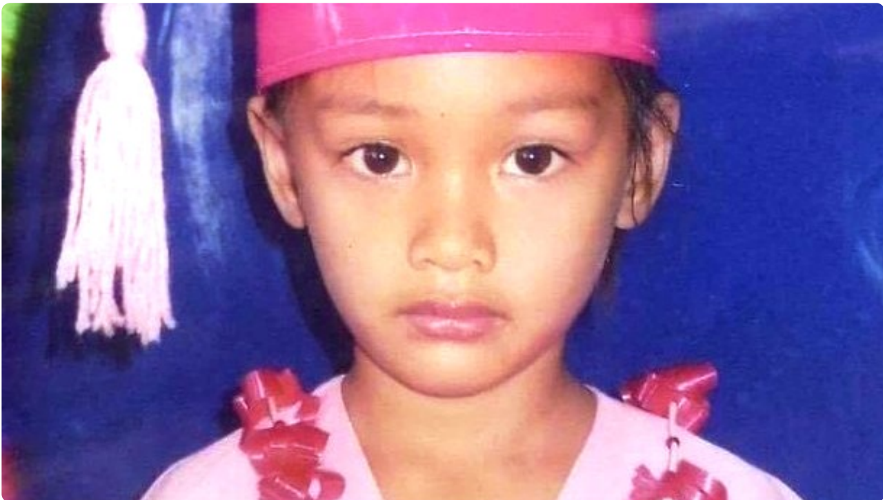
Murdered by Duterte.