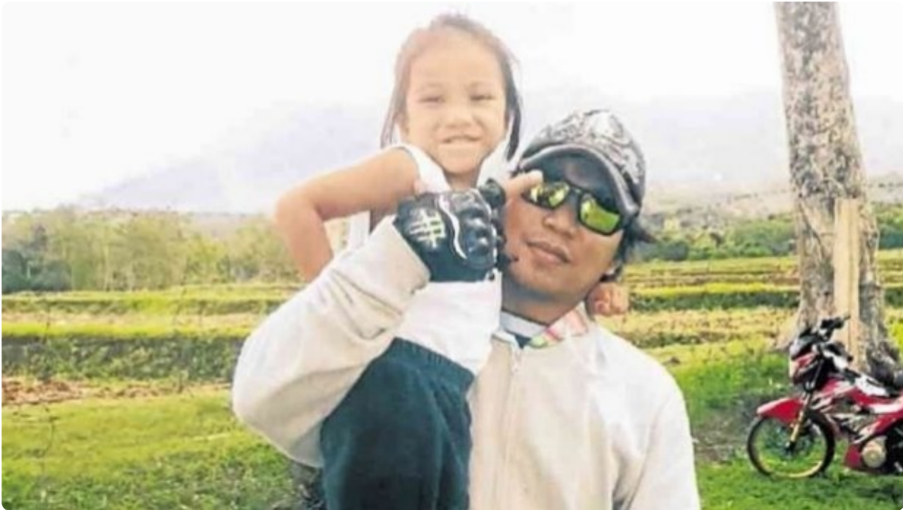
Little Girl Murdered by Duterte.