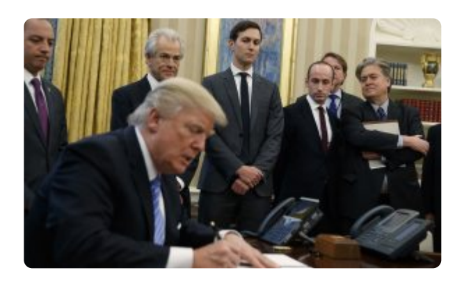
Where are the women?