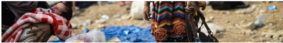
Innocent Mosul Kids