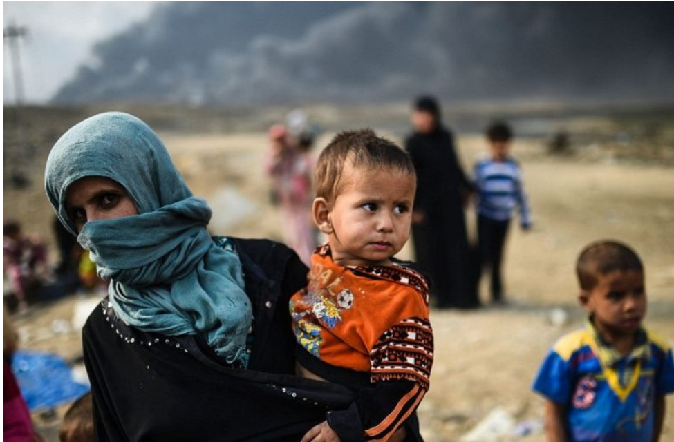
Innocent Mosul Kids