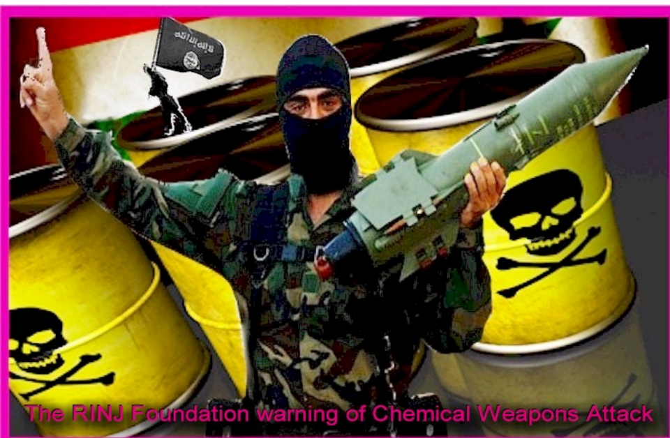
The RINJ Foundation warning of Chemical Weapons Attack

When Daesh explodes and disperses its Sulphur Mustard and sets alight its raw sulphur piles, people will not die immediately but in the weeks and months ahead, tens of thousands will die from respiratory ails and from damaged soft tissue in breathing and digestive tracts as the chemicals