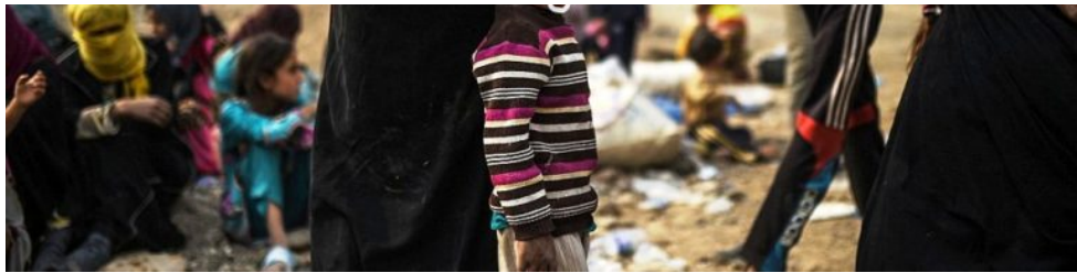
Innocent Mosul Kids