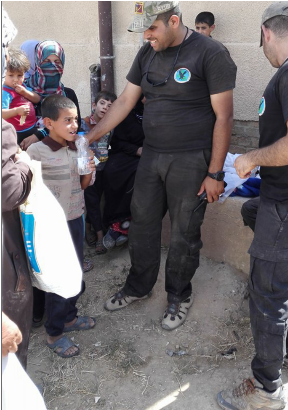
Innocent Mosul Kids