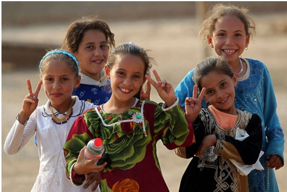
Innocent Mosul Kids