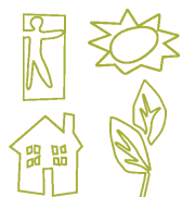
table of contents | PART 2