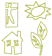
table of contents | PART 1